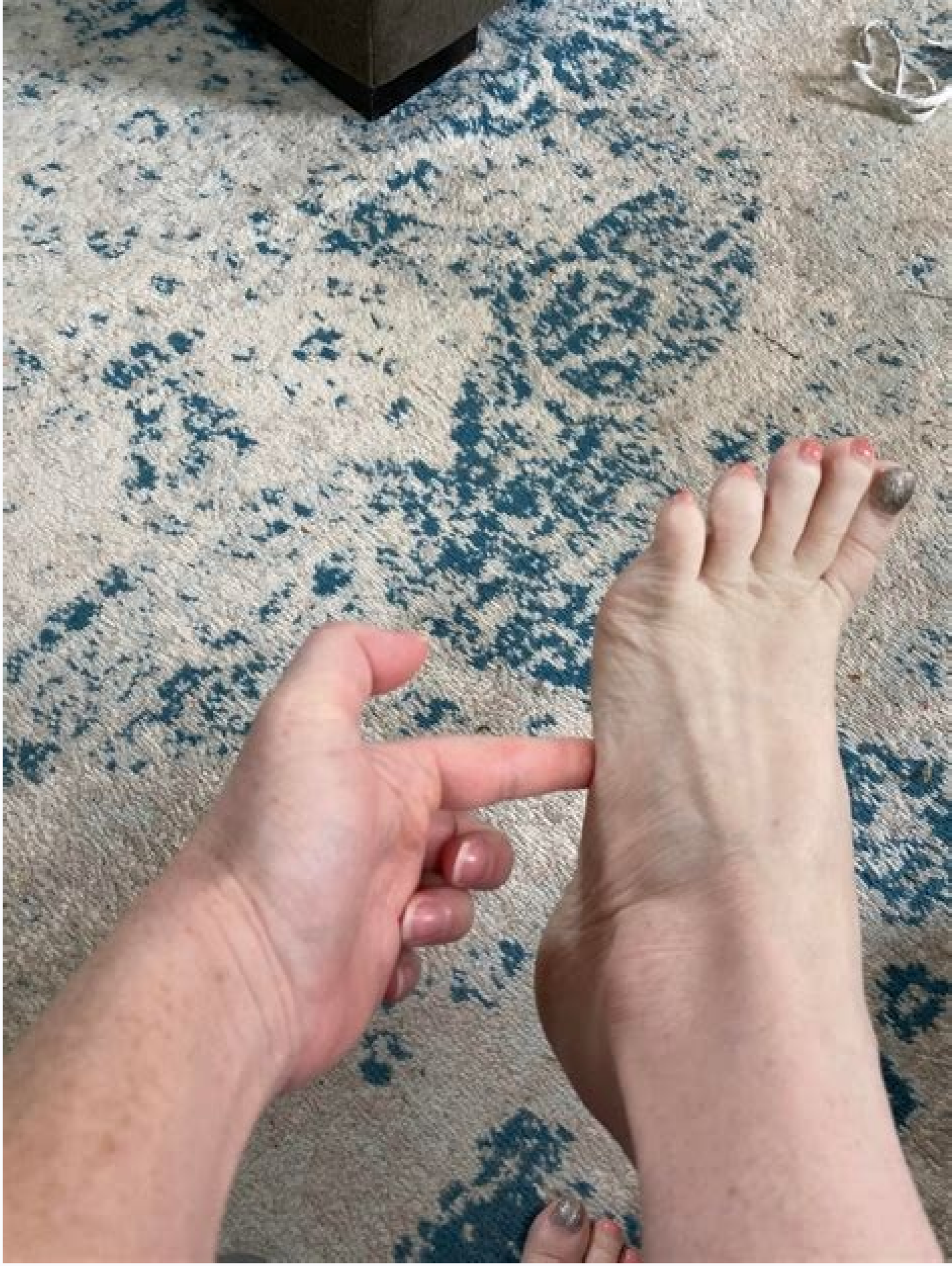
What does the bible say about toes. Does god have a big toe pdf.