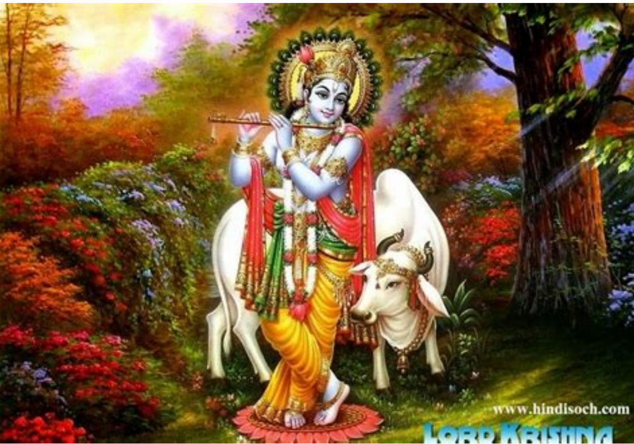
Bal krishna 3d live wallpaper.