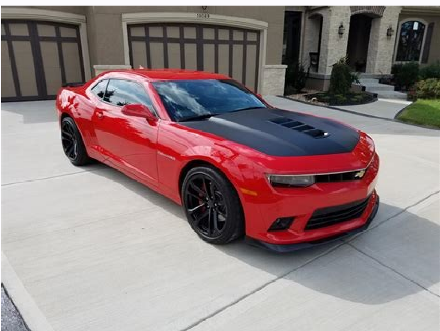
2011 chevy camaro rs owner's manual.