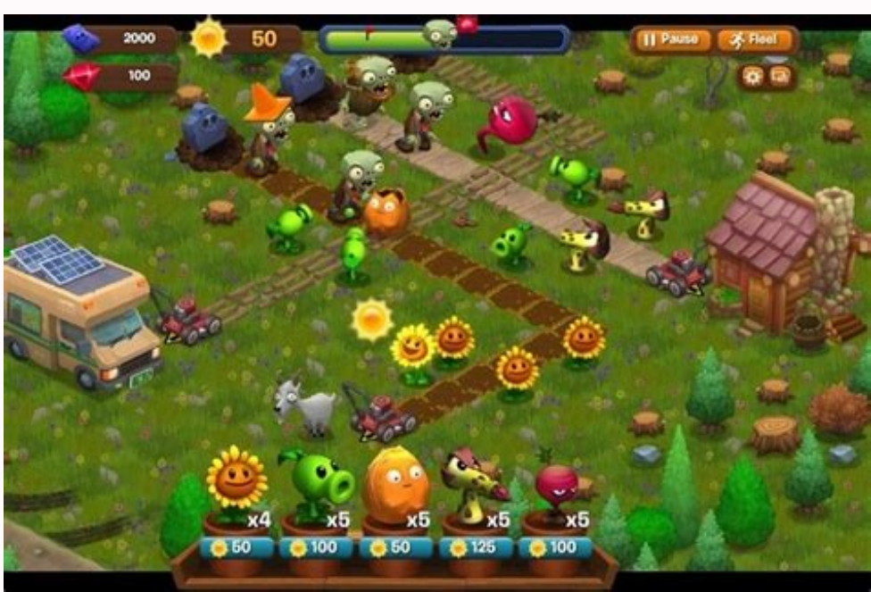
Pvz 2 mod apk for pc. Can you get pvz on pc. Pvz vs mode pc. Download pvz mod for pc. Is pvz free on pc. Is pvz2 on pc. Is pvz2 available on pc. Pvz mod apk for pc.